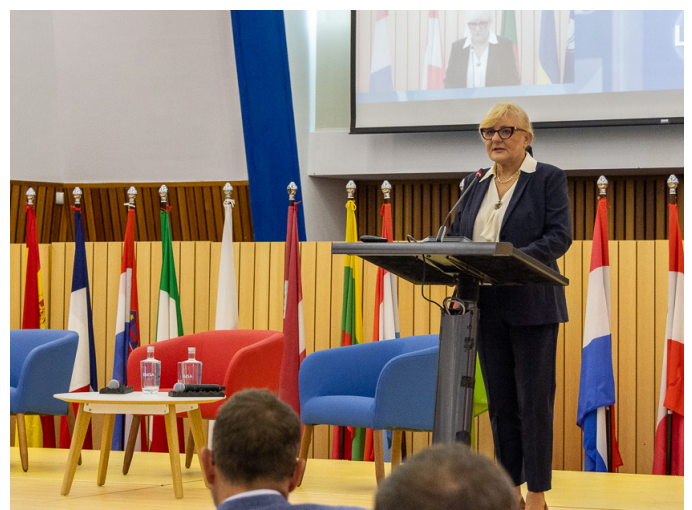
Our Executive Director opens the 3rd Maritime Cybersecurity Conference, held at EMSA.