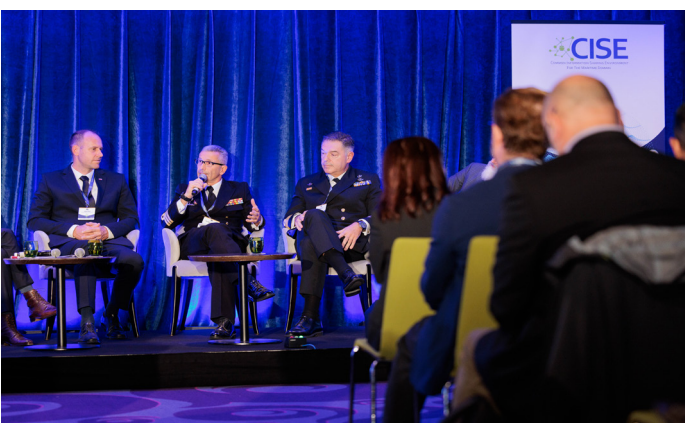
Delegates discussed the evolution of CISE and its future role in maritime security in the EU.